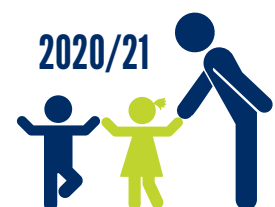
2020/21 2 children have required secure accommodation

The IRO Service provides the Independent Panel Chair for all Secure Reviews. This is a separate IRO to that of the child’s allocated IRO. Of these 2 children, 1 child has left Secure in a planned way at the time of this report.