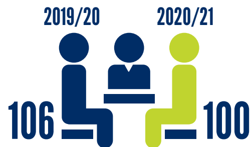
The number of resolution conversations

The number of resolution conversations that have taken place this year has remained relatively static. The primary reason for a resolution conversation has been delay in achieving a plan of permanence for a child or young person.